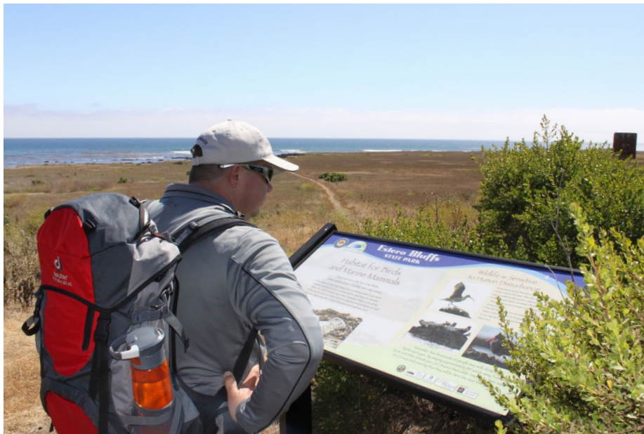
Interpretive panels are nonpersonal services.

Nonpersonal interpretation typically includes any written, audio, or visual messages provided for visitors without the use of direct personal contact with visitors. They may be designed to orient visitors, provide information or educate. Nonpersonal interpretation may be delivered in a variety of ways (see Table 1.1).